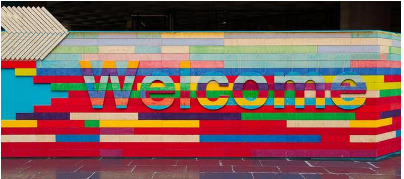
‘Welcome’ by Tony Hisgett ( CC BY 2.0 )

This week our readings reveal two different aspects of justice and mercy in action. We learn of Jesus entering the temple to find pilgrims shopping, having turned the temple from a house of prayer to a market place. The parable of the Prodigal Son who leaves home and returns greatly changed, reveals a pattern of rebellion, ruin, repentance, reconciliation and restoration.