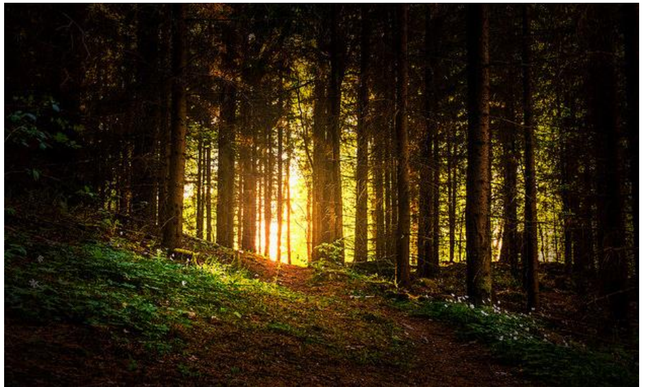
'Light and forest at Isblandskärret, Djurgården' by Tommie Hansen ( CC BY 2.0 )

... to live in this world you must be able to do three things: to love what is mortal: to hold it against your bones knowing your own life depends on it; and, when the time comes to let it go, to let it go.