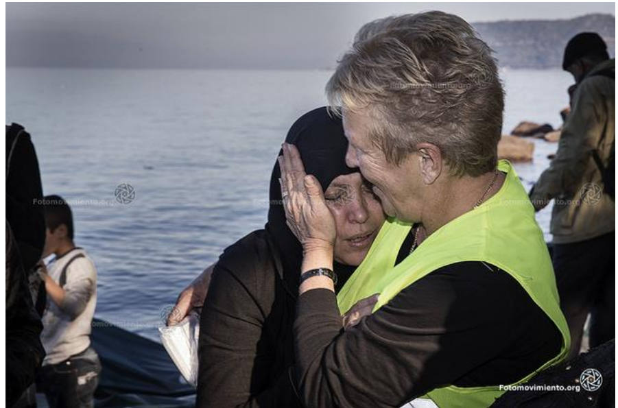
Untitled image of refugees arriving in Europe by Fotomovimiento ( CC BY-NC-ND 2.0 )

I come from a musical place Where they shoot me for my song And my brother has been tortured By my brother in my land.