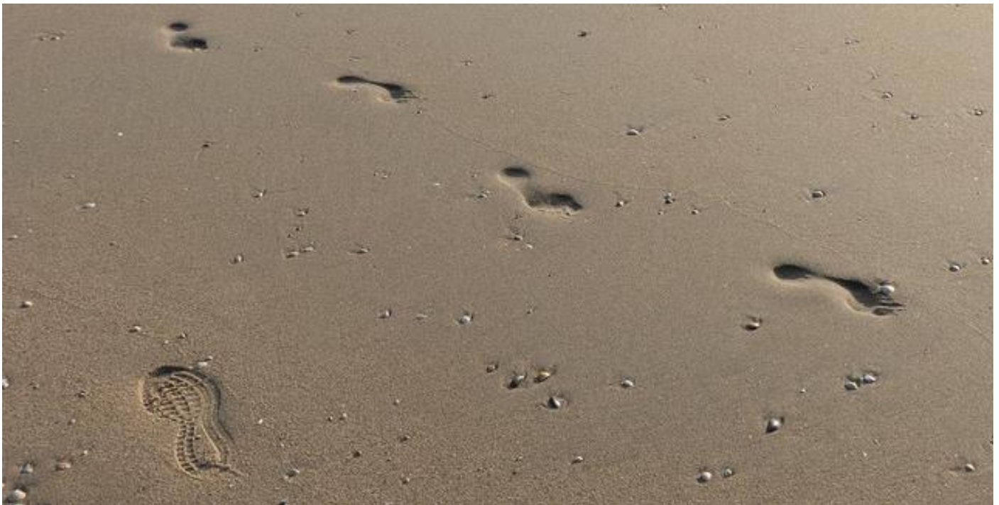
'Close Encounters'

A thought went up my mind today Nor where it went, nor why it came But somewhere in my soul, That I have had before, The second time to me, I know I've met the thing before; But did not finish,—some way back, Nor definitely what it was, It just reminded me—'twas all— I could not fix the year, Have I the art to say. And came my way no more.