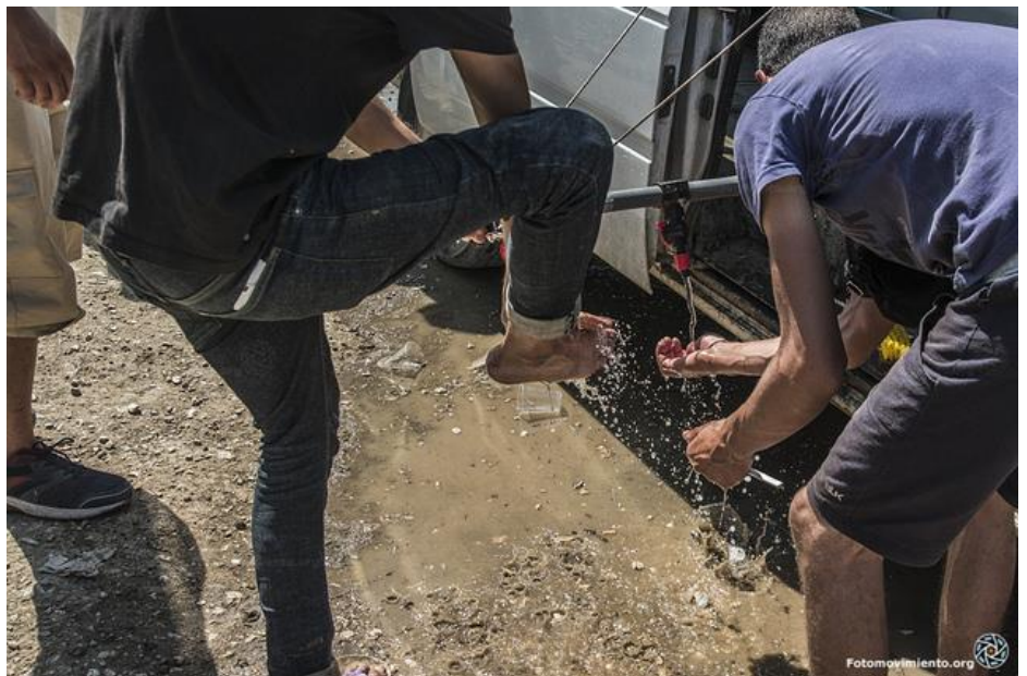
Refugees in šid (Serbia)

As the blind man was on his way to wash in the pool of Siloam at Jesus' command I wonder if he stopped and thought to himself, 'what am I doing, no one has ever heard of a man born blind being healed of his blindness. Who am I kidding.' Maybe he stopped many times before reaching the pool, but because he felt inner stirrings stimulated by a man called Jesus, he could not help but his satisfy the curiosity.