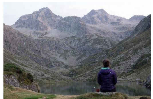
'Solo Hike Central Pyrenees' by Kitty Terwolbeck ( CC BY 2.0 )

At such times the awakening, the turning inside out of all values, the newness, the emptiness and the purity of vision that makes themselves evident, all these provide a glimpse of the cosmic dance.