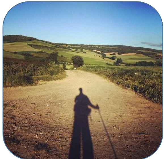
'Pilgrim on Journey'.