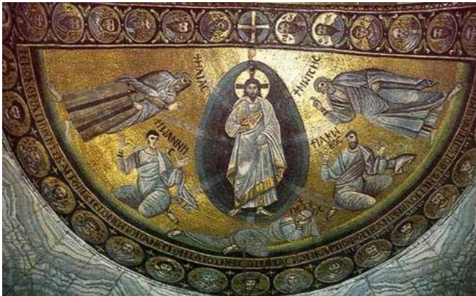
From St Catherine's in Sinai

Life is a process of continual change and movement in which we look for patterns and significance. The transfiguration links Jesus to the Old Testament figures of Moses (representing Jewish law) and Elijah (representing Jewish prophecy). Mark ties this story to the beginning of Jesus ministry, and similarly Temptation Sunday is the precursor to Jesus ministry.